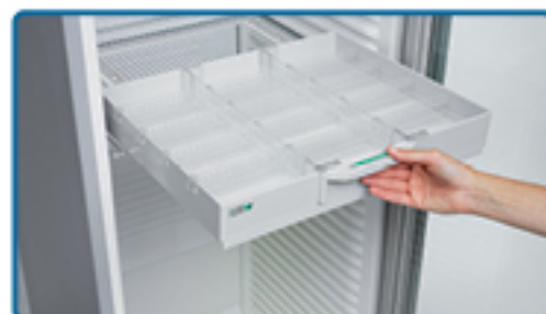
Option of drawers with dividers