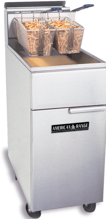
Shown with optional casters