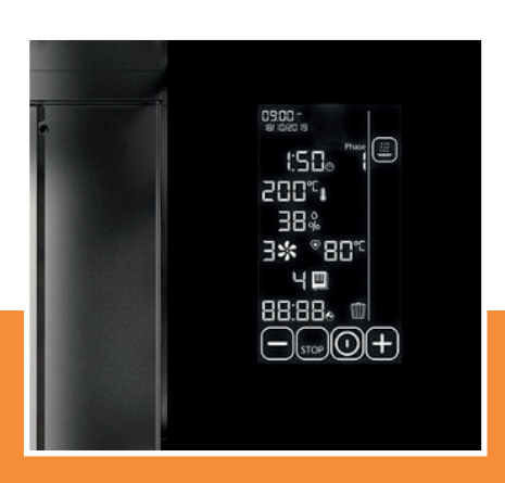
With an easy and clear operating menu