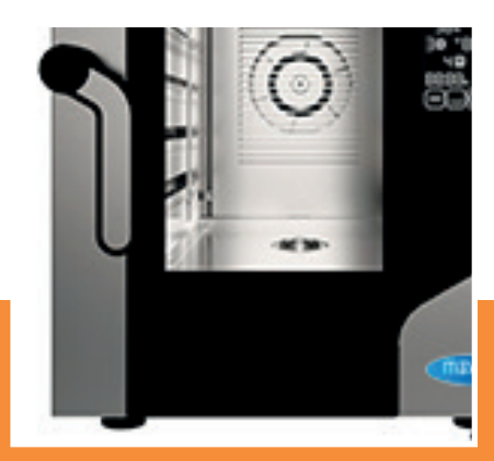
Only 50 cm wide